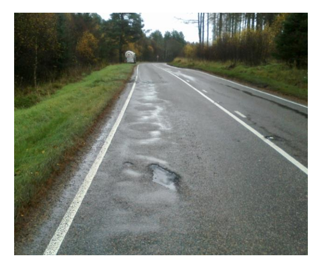
Figure 3: Pothole or substantial road repair?

Figure 4 shows the flowchart for selecting pothole repairs on strategic urban roads. The decision process includes factors related to response times and the severity of the defect. It is recognised that the response times required for this type of road will often affect the ability to select a permanent repair option first time. The 'Life of surfacing?' question explores whether the material has a limited expected life. Reasons can include new traffic calming schemes or developments as well as the surfacing nearing the end of its serviceable life. Guidance on the expected service lives of different repair techniques is given based on local authority responses collected during the study.