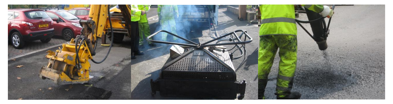
Figure 1: Examples of repair techniques: mini planer, thermal patching and jet patching.

A questionnaire was emailed to individuals associated with managing road repairs across the 32 Local Authorities in Scotland. Responses highlighted that a broad and diverse range of materials and techniques were being used. The authorities' expectations of the service life of the products and techniques revealed some disparities. Contact details were used to set up meetings to collect additional information. Meetings were held with individuals involved with the management and supervision of pothole repairs. Individuals' experience of using materials and techniques and the rationale for their specific use were discussed. Arrangements were made to see some of the materials and techniques in more detail with both managers and operators. Techniques and materials viewed in operation included hot mix asphalt, thermal patching, spray patching and a range of cold applied materials, including water setting.