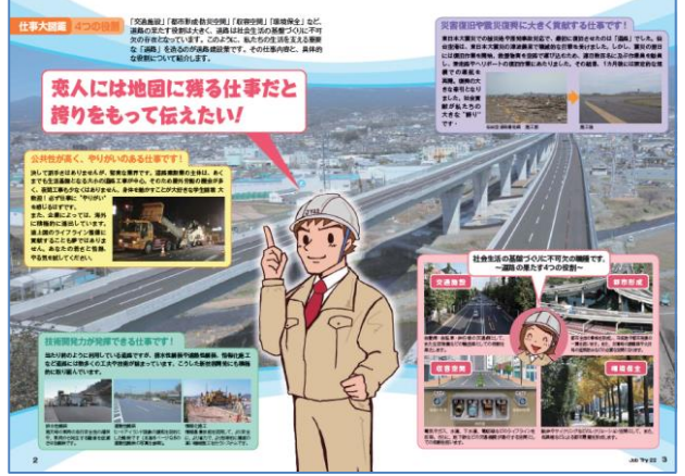
Figure 3: "I want to tell my sweetheart that my job will remain on the map". [6.]

To attract younger people to the paving industry in Japan they promote the understanding of the social, economic and environmental benefits which are derived from developing roads and road networks and they also appeal to the individuals' sense of self-worth (see Figure 3).