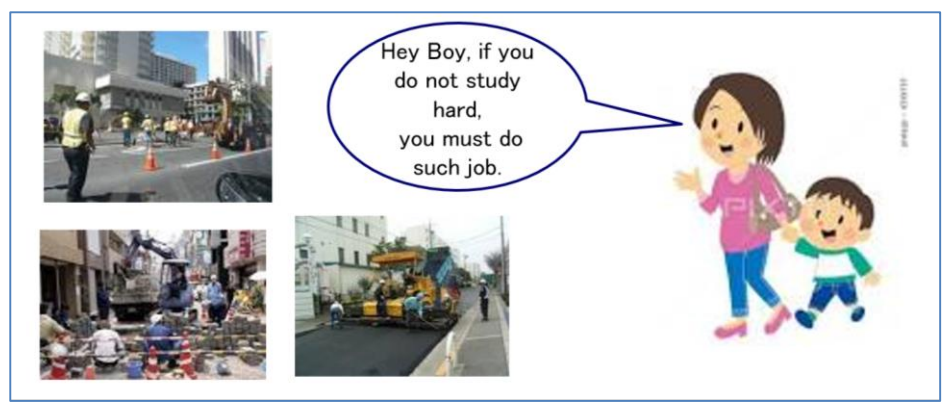
Figure 2: The perception of the status of road workers in Japan [6.].

To attract younger people to the paving industry in Japan they promote the understanding of the social, economic and environmental benefits which are derived from developing roads and road networks and they also appeal to the individuals' sense of self-worth (see Figure 3).