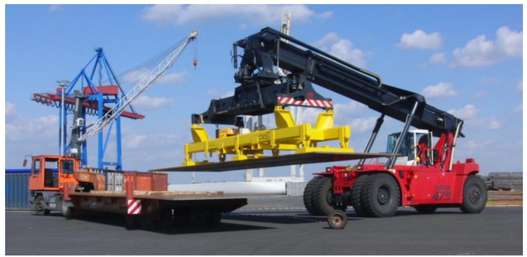
Figure 6: Handling of steel plates at the Niedersachsenkai