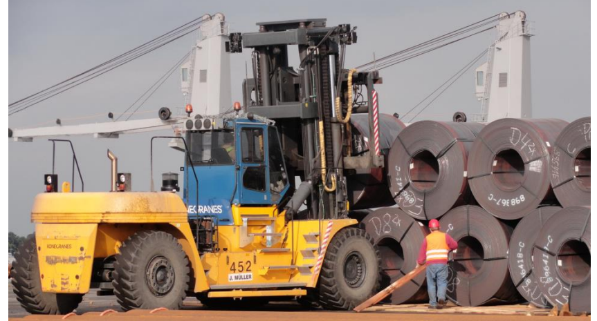
Figure 7: Transport and storage of coils at the Niedersachsenkai

The loading of the pavement is always accompanied by both a temporary settlement depression because of the elasticity of the pavement and by transverse forces with associated tensile strains due to the gradient of 1.5%. Usually this is not an issue. However, it led to an obvious crack in the joints in the adverse concurrence of very high loads resulting from the storage of coils and a severe winter, which exhibited longer-term temperatures of up to -20^{\circ} C, and thus a reduced elasticity of both the asphalt pavement and the joint sealant. Therefore and given such weather conditions, not only the bearing of the goods must be considered but also the number of layers of the stack must be reduced in order to decrease the resulting tensile strains at weak points. For the same reason the gradient was reduced to 1.0% for the storage areas planned and realised subsequently.