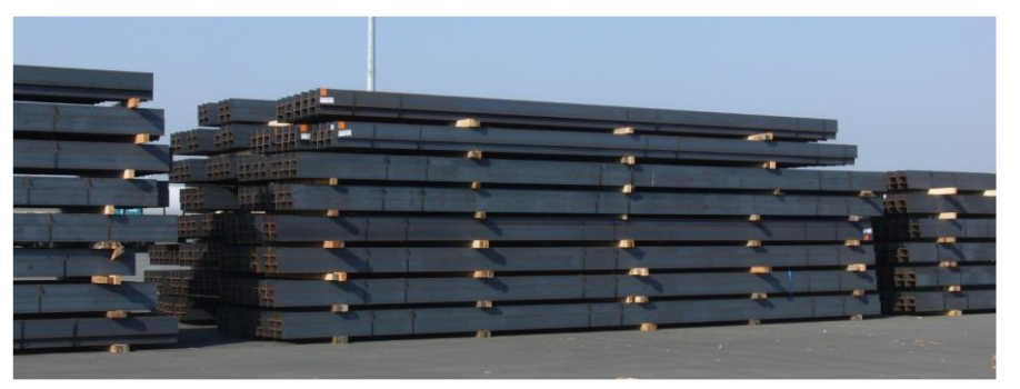
Figure 4: Storage of beams at the Niedersachsenkai