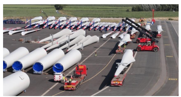
Figure 5: Transport and storage of parts of wind mills at the Niedersachsenkai