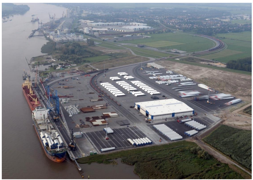
Figure 1: Overview on the Niedersachsenkai at the port of Brake

The paving system of both the quay area and the storage area was planned and designed by means of computational dimensioning according to RDO Asphalt 09 [1], which was particularly developed for the construction of highly trafficked roads. However, the use and load of the port area clearly differs from that one on roads. Therefore, the use, the load, and the basic conditions were analysed in detail first in order to create an adequate concept as well as to transfer the well-known method, which bases on long-term experience in road construction, appropriately to the application for the port pavement.