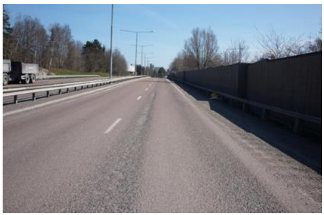
Figure 2: Severe raveling of double-layer PA after only one year of traffic.