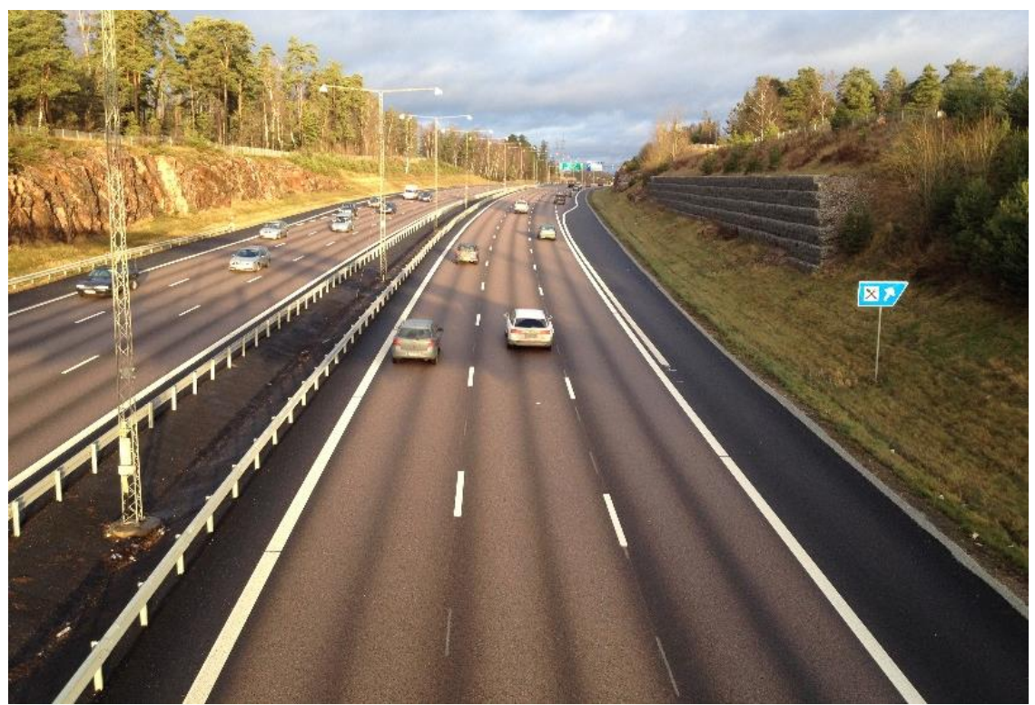
Figure 8: The test road E4 in Rotebro, Stockholm, after a few months of traffic.

The need for traffic noise reduction measures is great in Stockholm, including the approach roads, and one option of considerable interest is to use noise-reducing pavements. Based on the excellent results on E4 in Huskvarna, a test section on the E4 motorway in Rotebro (between Stockholm and Arlanda airport) was repaved with double-layer PA in the summer of 2014. This road has three lanes in each direction. See Figure 8.