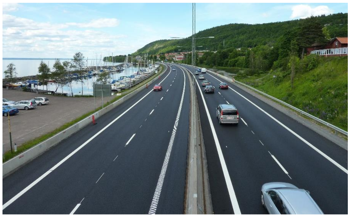
Figure 4: Test road on E4 in Huskvarna just after the pavement was laid in 2010.