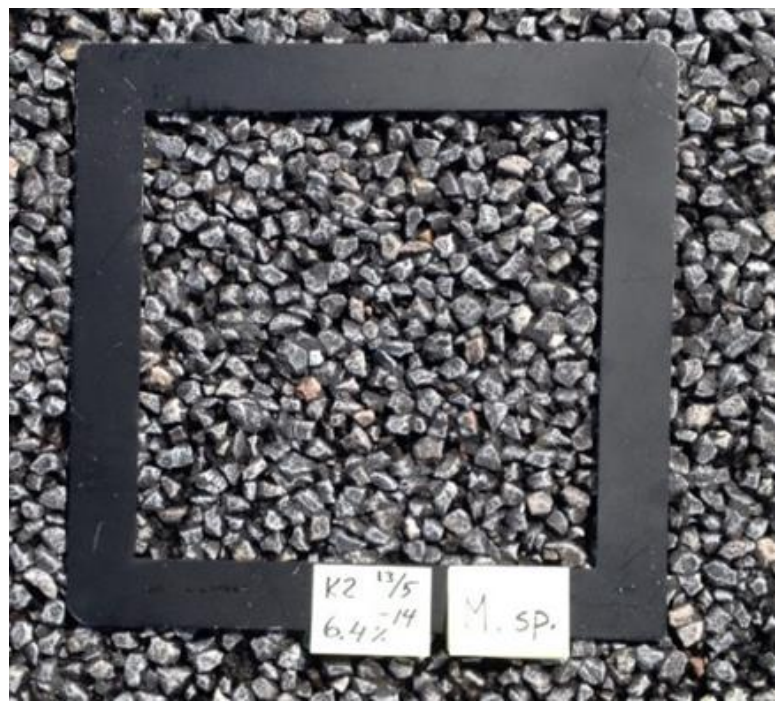
Figure 7: Stone content is high and the open pores are visible between the particles. The number of particles (8/11) within the frame is approximately 360 and three are lost. The pavement (K2 south with rhyolite) was four years old when this photo was shot.