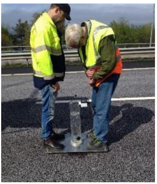
Figure 3: Measurement of the draining effect of a porous pavement according to EN 12697-40

The drainage ability of the pavements have been tested according to EN 12697-40 (Figure 3). The method is a field test of the drainage ability of asphalt pavements that are designed to have permeable properties. The outflow time for water is an indication of the pore capacity to drain water away from the pavement. The method can be used to check if the surface meets the demands on drainage and any deterioration of drainage capacity with time, for example clogging by road debris. No requirements on permeability are related to this method for PA.