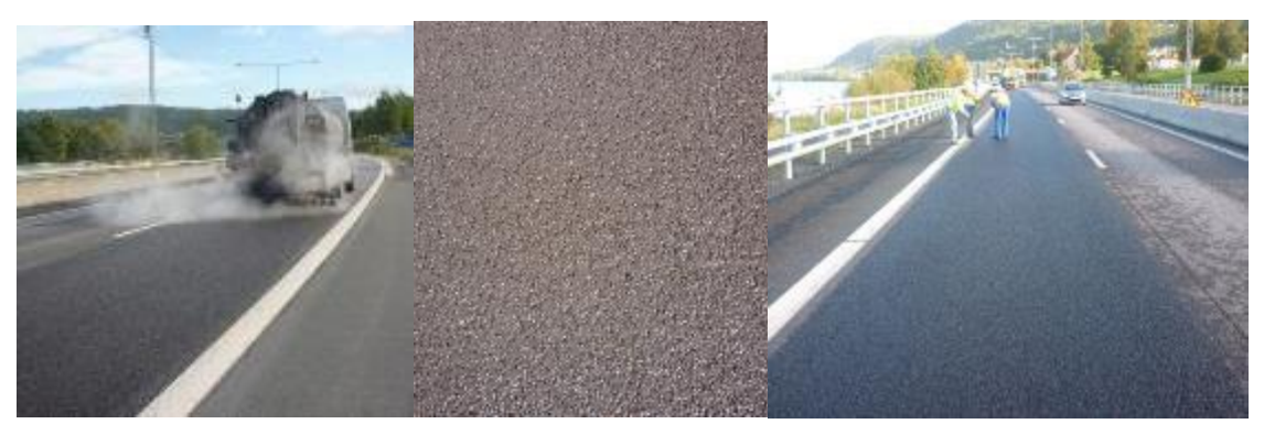
Figure 5: Sealing with Fog Seal of the PA on E4 in Huskvarna, September 2010.

A distance of about 200 m in K1, southbound direction, was sealed in the fall of 2010. Another seal was conducted in autumn 2011 on half of the section that was sealed in 2010. As reported previously, stone losses have been small on these sections. In the autumn of 2013, the entire K1 in both directions was sealed (Figure 5).